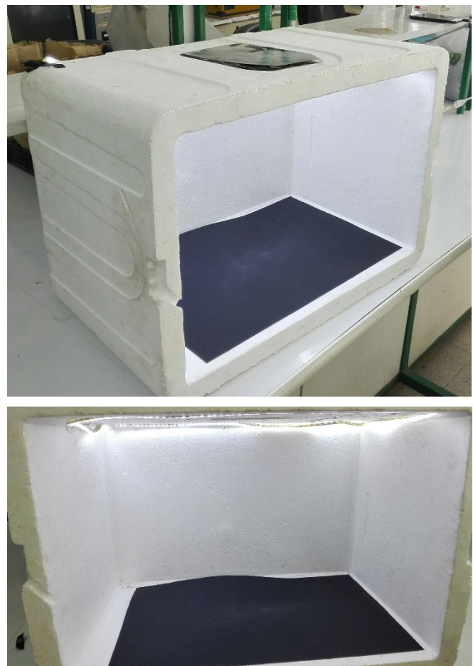
Figure 2. The imaging box in operation with the lid open.

In the next step, ImageJ (National Institutes of Health, United States) [16] was used as an image processing software to analyze the acquired images and extract the color values of the captured images in RGB color space.