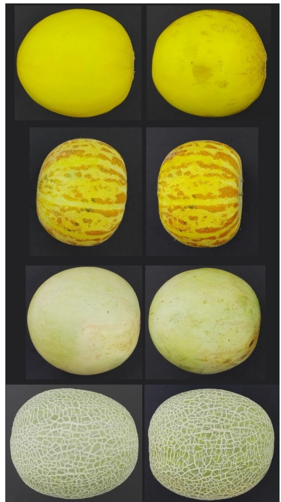
Figure 4. Sample images for different genotypes of melon. Each row represents a genotype. The left column is the sample at harvest, while the right column represents the same sample after one month of cold storage at 4 °C.

Minitab software. Furthermore, The total color changes during storage period were calculated using CIEDE2000 color-difference formula [20] Eq. (1).